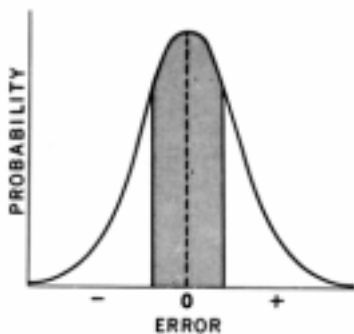
Figure 2302. Normal curve of random error with 50 percent of area shaded. Limits of shaded area indicate probable error.

The normalized curve of any type of random error is